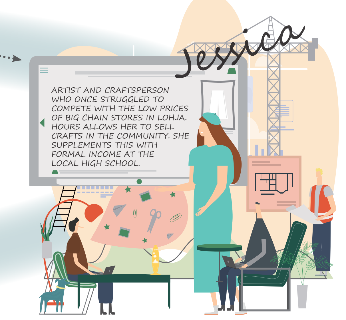
PUBLIC HIGH SCHOOL